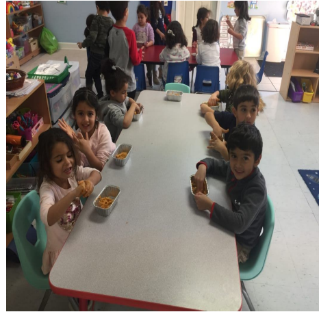
Making Pumpkin Pie (Pre-K)

Every time they see the stickers, they remember to be kind to each other (Pre-K)