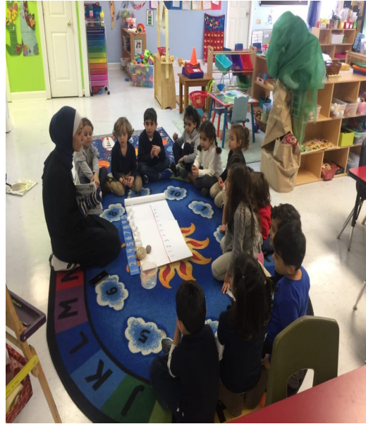
Learning Number Line (Pre-K)