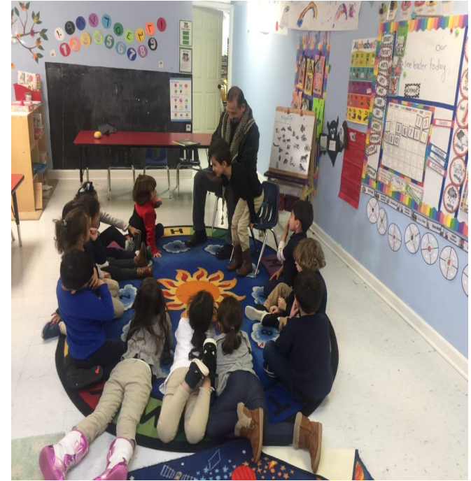
Parent Reading Day (Pre-K)