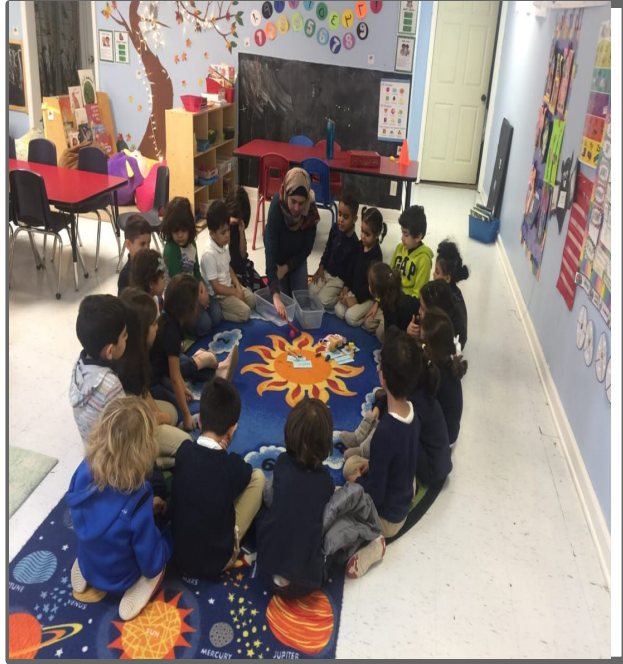
Experiment with magnets, what's magnetic and what's not.