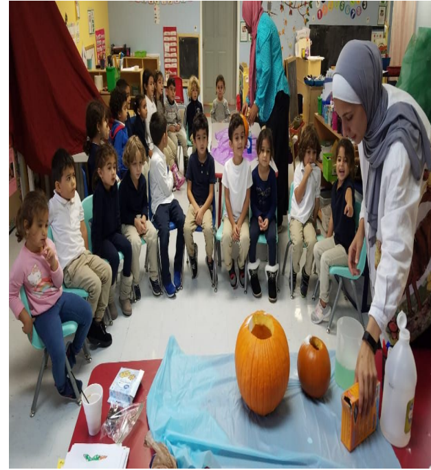
Pumpkin Eruption Experiment (Pre-K)